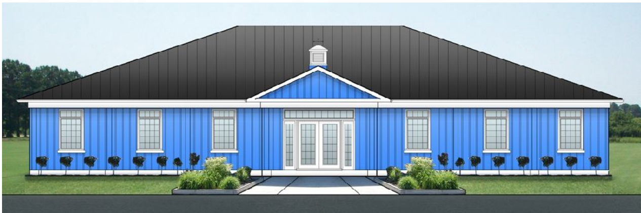
Artist's rendition of proposed building

Capital Campaign: Fundraising Goal is $1,000,000, of which a substantial portion is already committed, to purchase land and construct ARC Industries East Wellington in Erin. Total Cost of Project will run approximately $1,100,000. There will be naming opportunities and donor recognition. More than 99% of donations will go directly to the project. We anticipate construction to begin late fall 2011 or early spring 2012. The campaign will be Publicly Launched in June 2011 and is expected to run until November 2011. In order to accomplish these objectives, we will need the support of our members and the community.