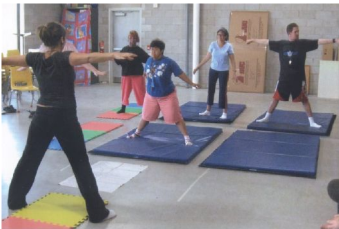
Enjoying a Yoga class in the gym.

Our members also put together 4 gift baskets for the raffle at the Spring Fashion Show. We assisted with the Spring Garage sale by providing volunteers to prepare and work that day. A big thank you to everyone this year who continue to give of their time and expertise. It's wonderful to see the results when we visit our programs. After all, it's our young people who benefit.