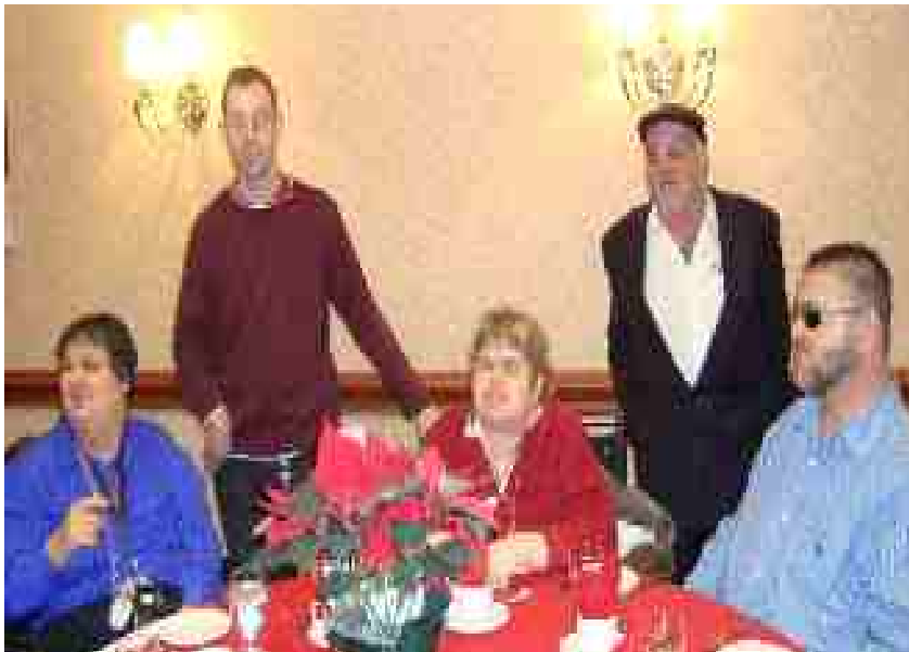
CNIB Night at the Holiday Inn.