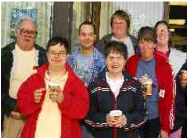
Sharing a coffee break in support of Alzheimers