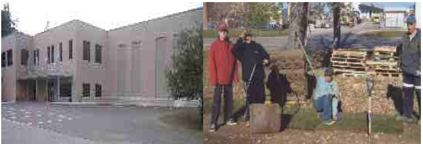
Planting for the environment at ARC