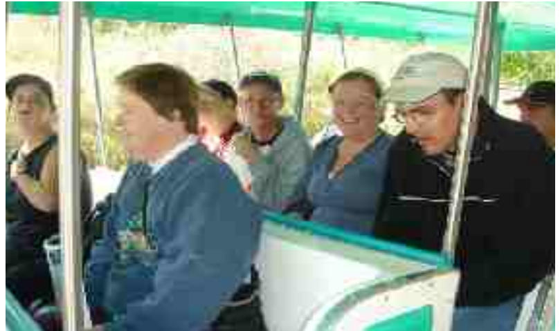
Enjoying the Zoomobile!