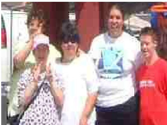
Fun at St. Jacob's market